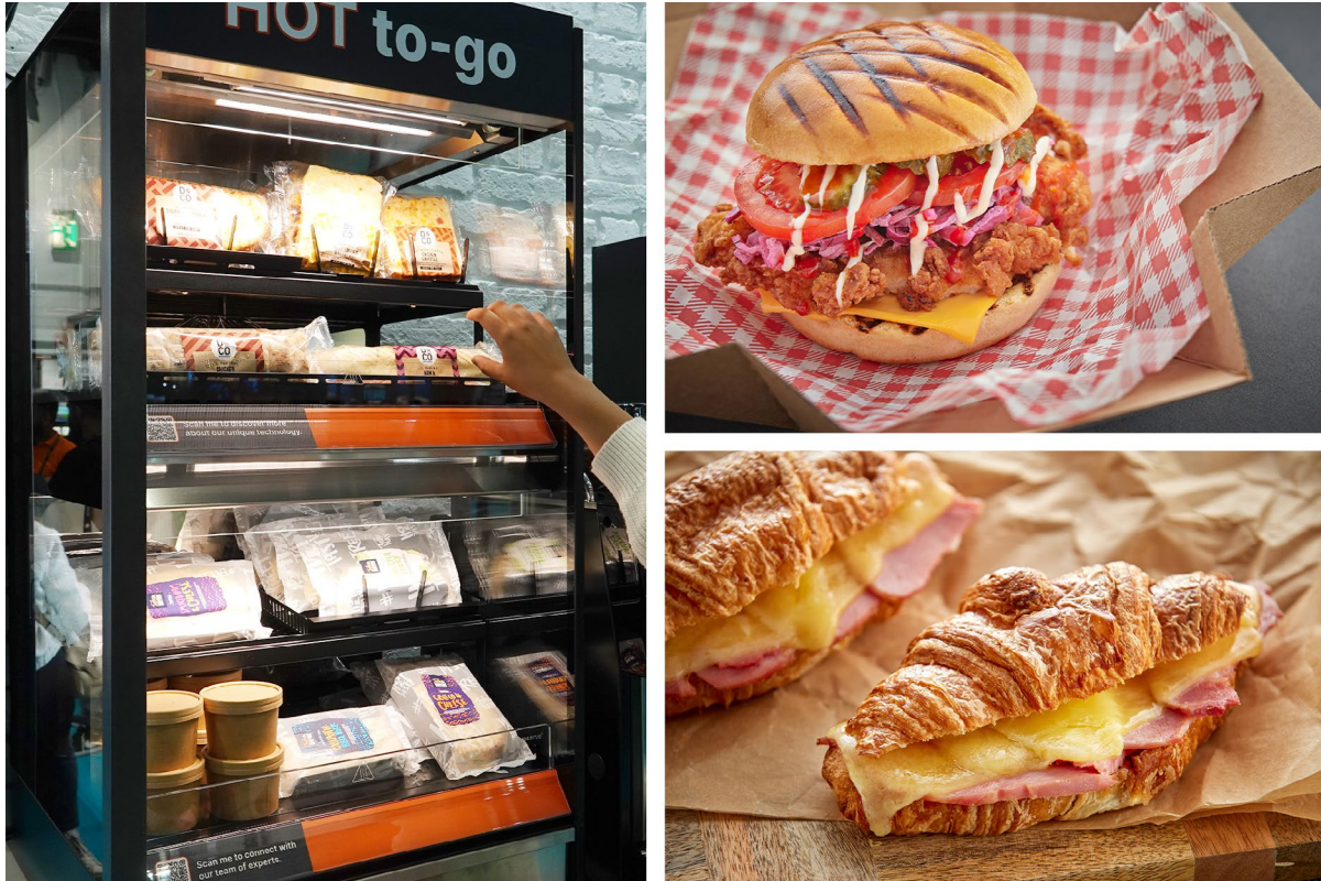
Flexeserve Zone Xtra, delivering high capacity hot-holding – on the counter

Featured in the NACS Cool New Products preview room, the company will be launching its latest heated display – Flexeserve Zone Xtra , which you can vote for at the show.